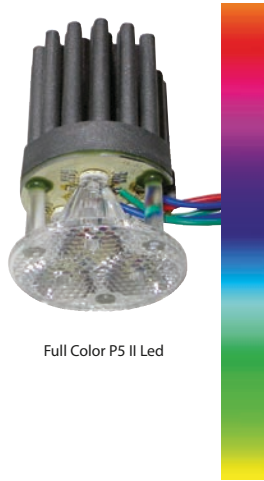
Full Color P5 II Led